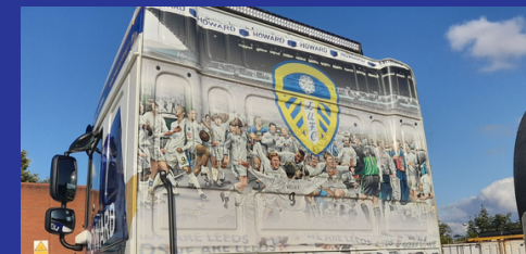
Some photos of our new DAF truck, including the gorgeous nod to LUFC!